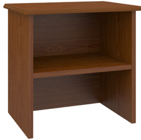
Model: LABH 20.5W 11.75D 20H

The Lancaster Collection offers unobtrusive refinement and skilled craftsmanship to form the perfect balance between function and beauty. Rich OG detailing on the tops and recessed insert panels set into chamfered frames on doors and drawers. Collection available with or without contrasting edges as well as custom color combinations.